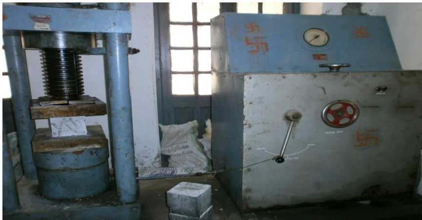
Figure 1. Testing of Specimens